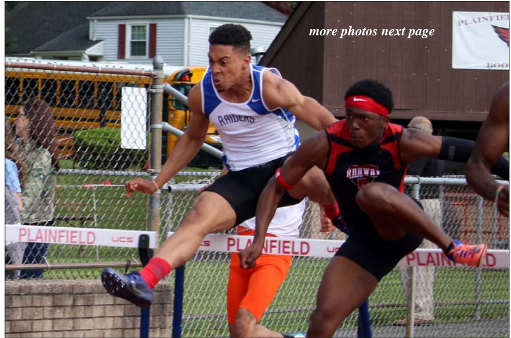
more photos next page