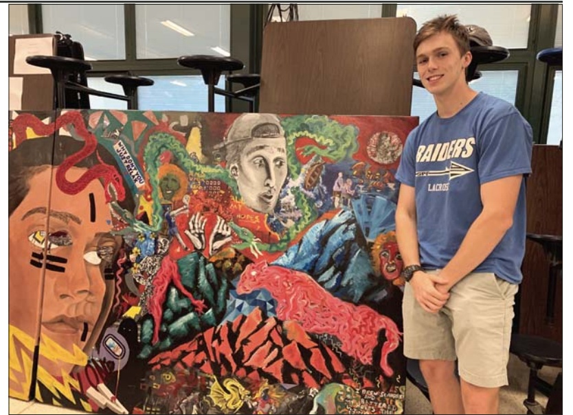
SENIOR PROJECTS... A senior at SPFHHS stands in front of a mural during The Senior Project Experience and Tomorrow's Teachers Program on June 19.