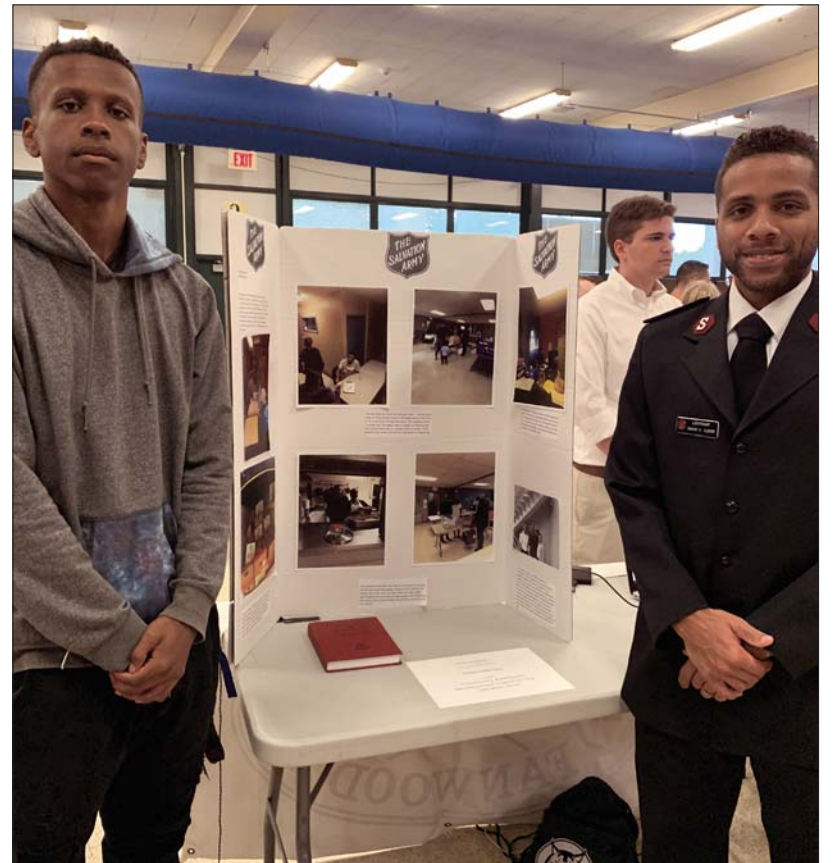
HELPING THE COMMUNITY... On June 19, seniors from Scotch Plains-Fanwood High School (SPFHHS) presented their projects for The Senior Project Experience and Tomorrow's Teachers Program. These seniors present on community awareness.

SPFHHS had over 60 seniors participate this year. Some of the projects included apprenticeships; community awareness development projects; documentaries; internships and creating murals. Additionally, there were many students participating in Tomorrow's Teachers where they assisted teachers in both elementary and middle schools.