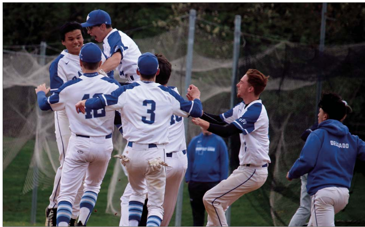
UNION COUNTY TOURNAMENT CHAMPS...The Raiders celebrate after defeating the AL Johnson Crusaders, 4-0, for the Union County Tournament Championship at Kean University in Union.