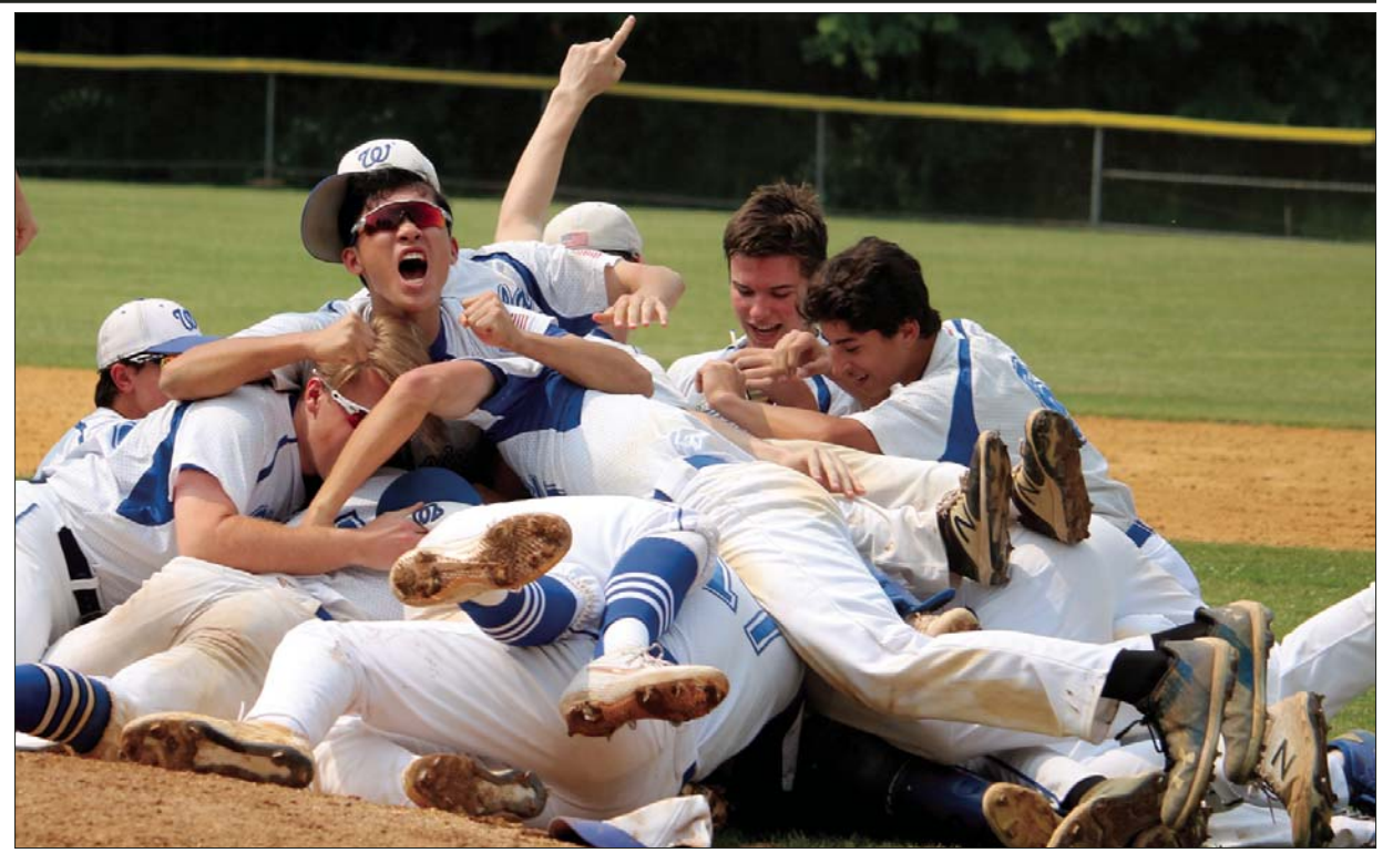
SECOND STRAIGHT SECTION TITLE...The Blue Devils celebrate after defeating the Ridge Red Devils, 4-2, at Ridge High School for their second straight North Jersey, Section 2, Group 4 title. The Blue Devils defeated Millburn last year.