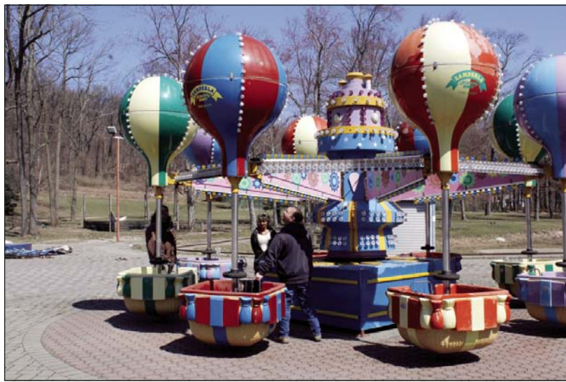
LOOKING FOR GOOD DEALS...Interested buyers at last Wednesday's auction at Bowcraft Amusement Park sorted through amusement rides as the area landmark prepares to close. The Route 22 property is to be developed into an apartment and townhome complex.