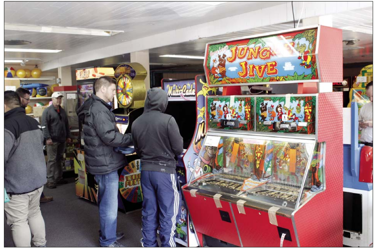
ARCADIE GAMES BUYERS...Interested buyers at last Wednesday's auction at Bowcraft Amusement Park sorted through arcade games, bags of toys, kitchen equipment and amusement rides as the area landmark prepares to close. The Route 22 property is to be developed into an apartment and townhome complex.