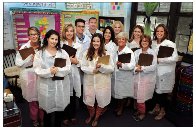
SCIENCE MINDED... Westfield teachers prepare for the Education Fund's Family Science Night, to be held on Thursday, October 16, beginning at 7 p.m., at Westfield High School. This event will feature various experiments and demonstrations, with proceeds supporting the Education Fund's fund-raising efforts for technology and innovative learning programs in Westfield schools.