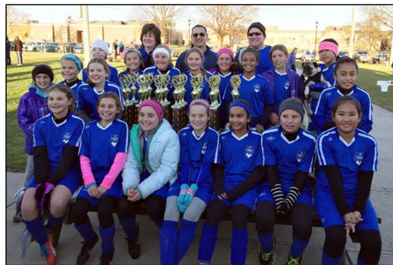
VICTORIOUS IN THE FINALS... The Scotch Plains-Fanwood Retrievers were victorious in winning their Intercounty Youth Soccer League Final on November 15 at Finals Fest held in Edison. The Retrievers are comprised of fifth graders that just entered the competitive full-sided league this past fall. The team enjoyed traveling to local towns to compete and finished their season with a very strong 9-1-1 record.

See it all on the web in color... www.goleader.com