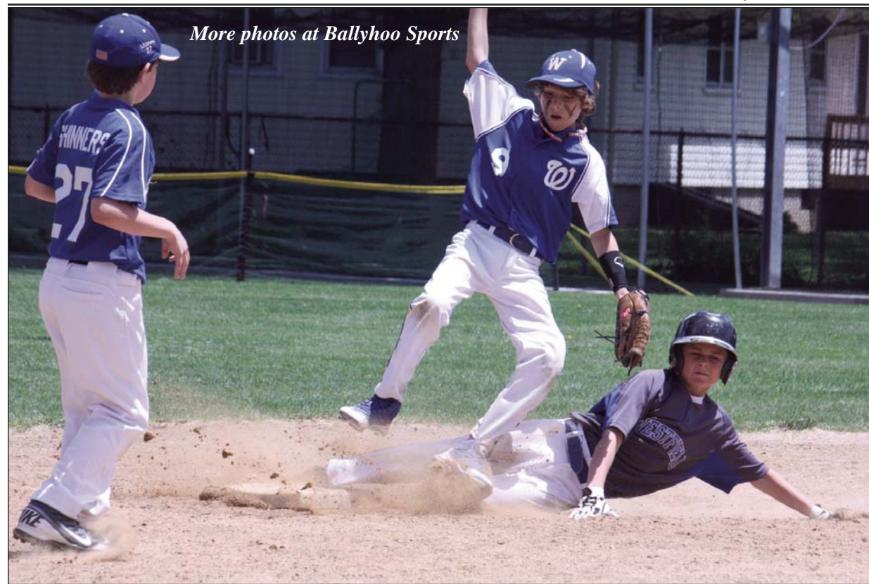
More photos at Ballyhoo Sports