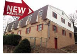
For Lease: Mountainside