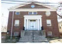
For Sale: Cranford

© 2014 Coldwell Banker Commercial NRT. All Rights Reserved. Operated by a subsidiary of NRT LLC. Coldwell Banker® and the Coldwell Banker logos are registered service marks owned by Coldwell Banker Real Estate LLC.