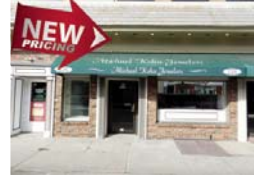
For Lease: Westfield