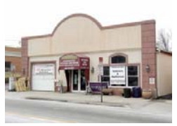
For Sale: Garwood