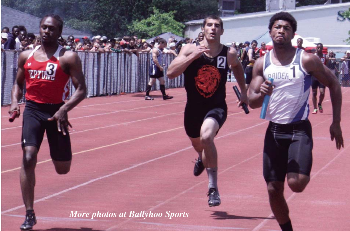
More photos at Ballyhoo Sports

We have MORE listings in Scotch Plains, Linden, Roselle, Edison & Bound Brook We can help with ALL of your Commercial Real Estate needs