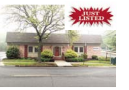
For Lease: Westfield