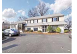
For Sale: Clark