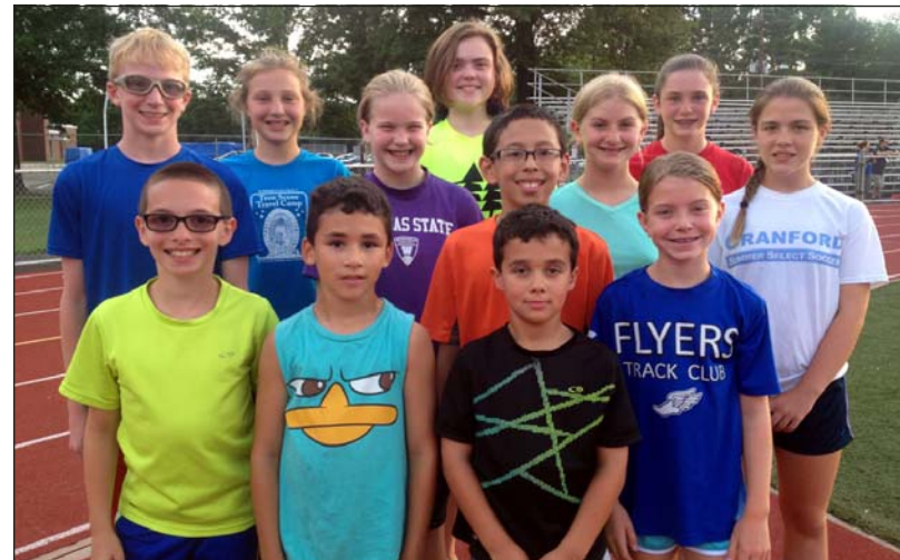
NATIONAL QUALIFYERS...These 12 Westfield "Y" Flyers will be competing in the USATF and AAU national championship meets.