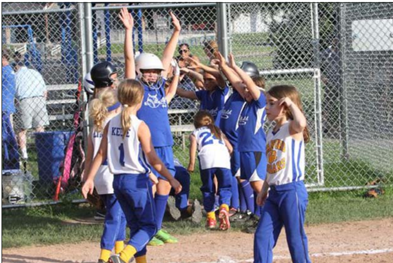
Westfield White 8U girls celebrate after defeating Cranford Blue, 9-8

It was the second meeting between Westfield White and Cranford Blue. The first was in a June tournament in which Cranford prevailed, 11-10, in a walk-off. The coaches agreed their teams are well matched, and played two of the hardest fought, most exciting games of the season.