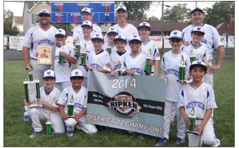
RIPKEN DISTRICT 12 CHAMPIONS - The Westfield 10U baseball team