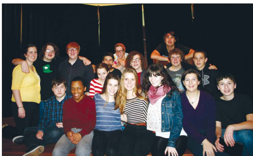
CALLING ALL ACTORS...The Pineda Conservatory's Center Stage Program for talented high school students is holding auditions for its five-week summer program that includes fully staged productions of Jonathan Larson's Rent and a musical revue entitled A Road Trip . Pictured above, the cast from a previous production.