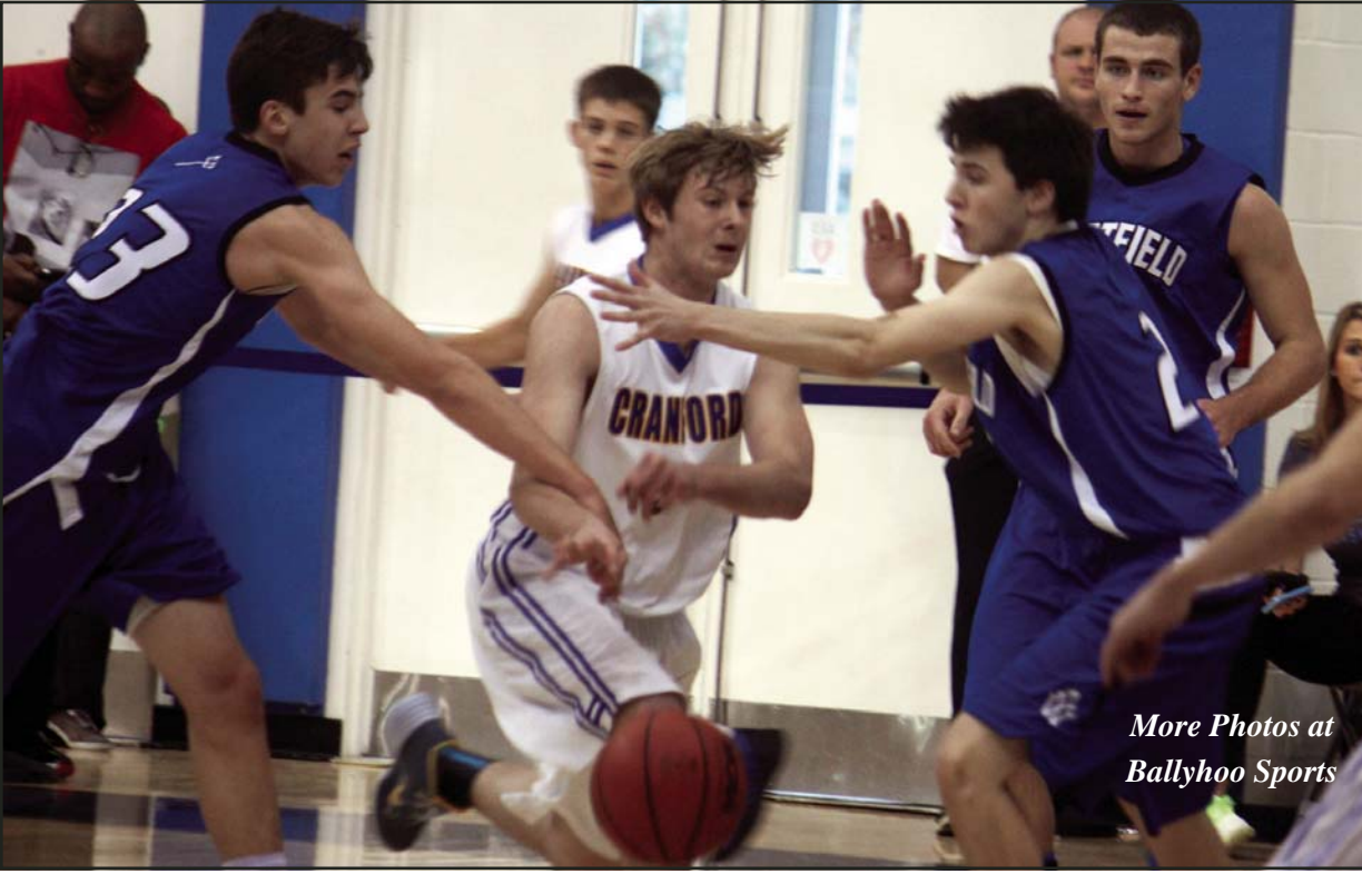
More Photos at Ballyhoo Sports