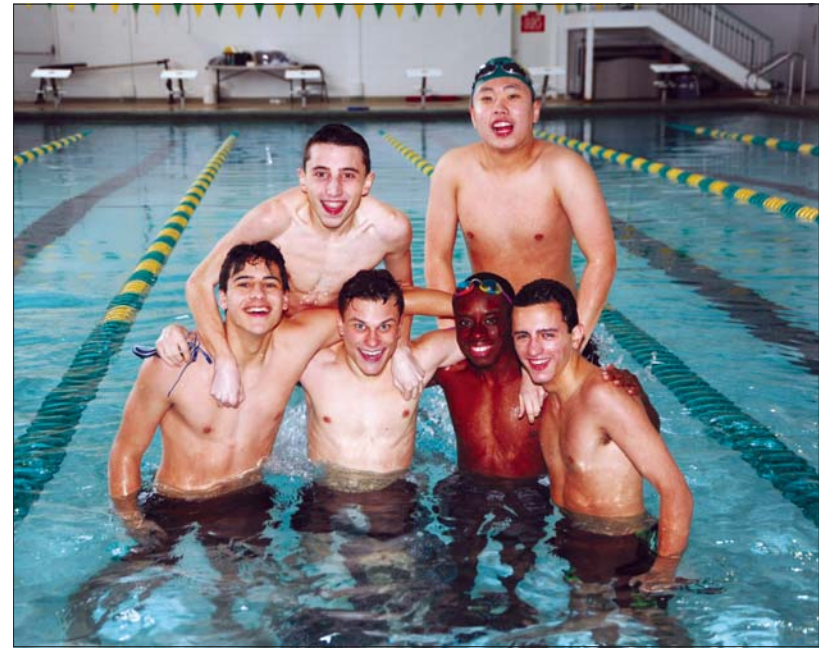
RASING FUNDS...Varsity swimmers take a break in between laps at the annual Wardlaw-Hartridge “sWHoop-A-Thon.”

To qualify for the Dean’s List, students must earn a 3.30 G.P.A., have no incompletes, and have no grade lower than a “C” for the semester. Full-time students must carry 12 or more graded credits for the semester.