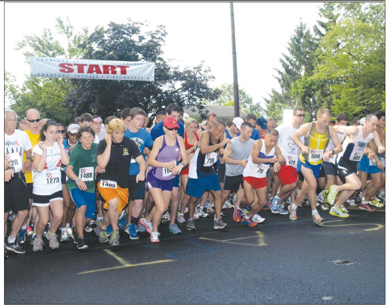
FOURTH OF JULY FESTIVITIES...Participants in the Cranford Conoe Club's annual race compete for the finish line on the Rahway River as runners cross the starting line at the annual Firecracker 4-Miler held in Nomahegan Park in Cranford.