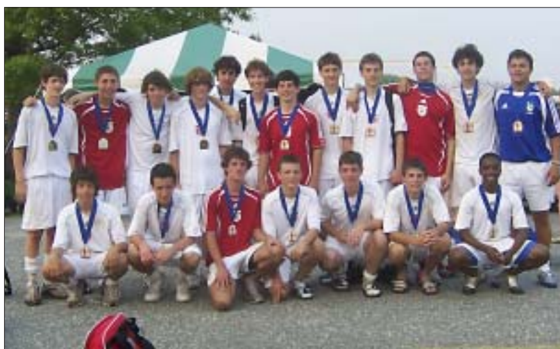
MEMORIAL DAY CHAMPS...The F.C.C. Arsenal (a soccer club team comprised of Westfield and South Orange boys) won first place at the Memorial Day MSSL Expulsion and College Showcase held at Fort Dix. It was comprised of U16-U19 teams from Md, Delaware, NJ, Pa and Ct. The final was against a Ct. team.