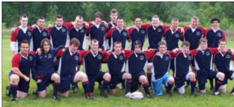
The Union County Rugby Football U19 boys