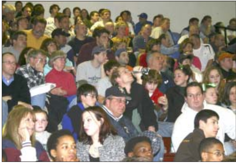
WAITING FOR THE FINALS... Wrestling fans await the beginning of the Region 3 wrestling championship round at Union High School on March 4.

PUBLIC NOTICE PUBLIC NOTICE NEW JERSEY DEPARTMENT OF TRANSPORTATION DIVISION OF PROCUREMENT, BUREAU OF CONSTRUCTION SERVICES 1035 PARKWAY AVENUE, PO BOX 605 TRENTON, NEW JERSEY 08625