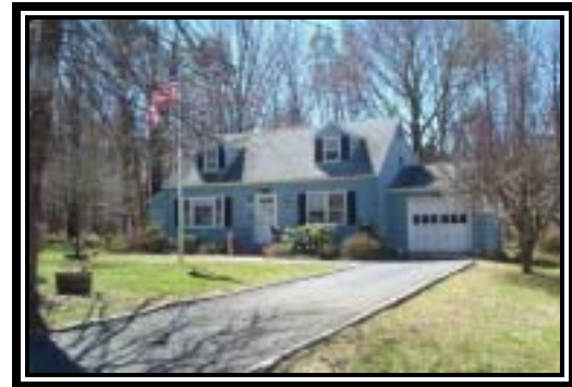
Scotch Plains $499,000 PRIVACY PLUS

Large three bedroom, one and one half bath split level home situated on a generous park-like property on a quiet, tree lined street. Features include an eat-in kitchen, living room w/fireplace, family room, attached garage central air, thermo windows, hardwood floors, deck & more.