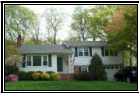
Scotch Plains $589,900 METICULOUS HOME

Ready for summer occupancy. This classic home is perfect for entertaining. Features include 4 bedrooms, 2.5 baths, large kitchen with wood cabinetry and granite counters, opening into a large family room with fireplace, deluxe trim package and more. Cul-de-sac location.