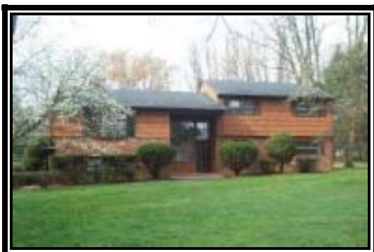
Scotch Plains $799,000 GOLF COURSE VIEW

Adam Borr uses "Dartfish Software", which analyzes strokes through slow motion video