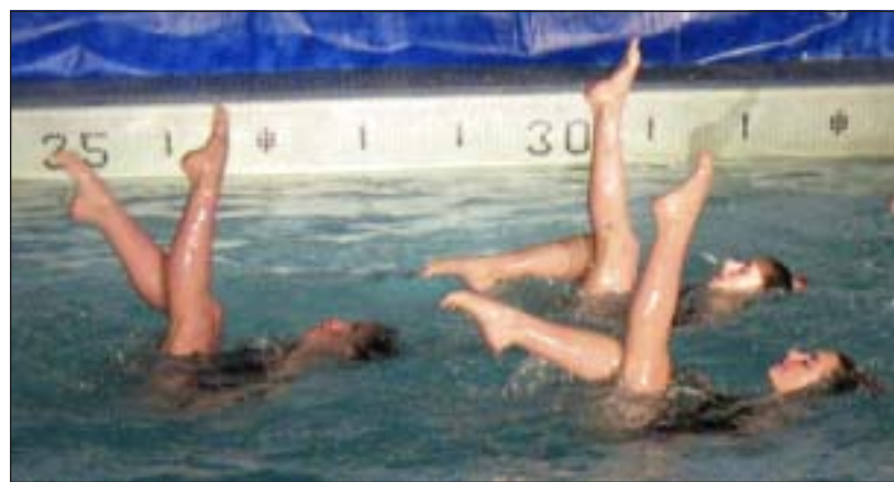
The Westfield Area Y Aquaducks