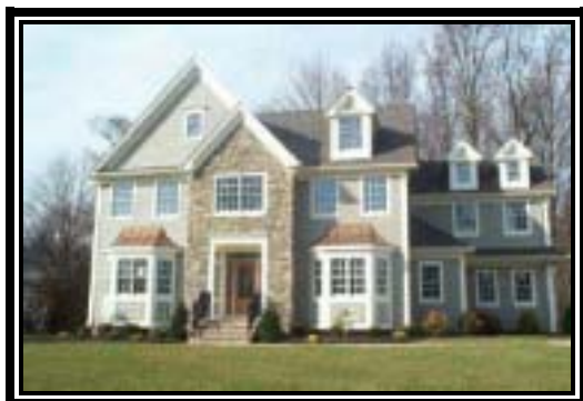
Scotch Plains $1,150,000 NEW CONSTRUCTION

Large four bedroom, three bath home set on almost an acre of park-like property on a quiet, tree lined street. Features include 2 story glass entry, large living with wood burning fireplace, hardwood floors, 2 car attached garage and oversized deck. Mother/daughter possibilities.