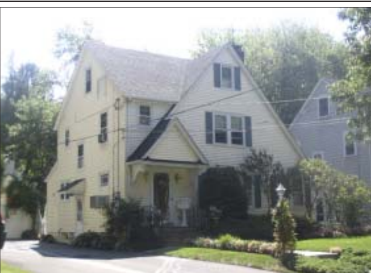
Pristine 4 Bedroom 2 Full Baths Colonial near Wilson School. $658,000

© 2005 Coldwell Banker Real Estate Corporation. Coldwell Banker® is a registered trademark licensed to Coldwell Banker Real Estate Corporation. An Equal Opportunity Company. Equal Housing Opportunity. Owned and Operated by NRT Incorporated.