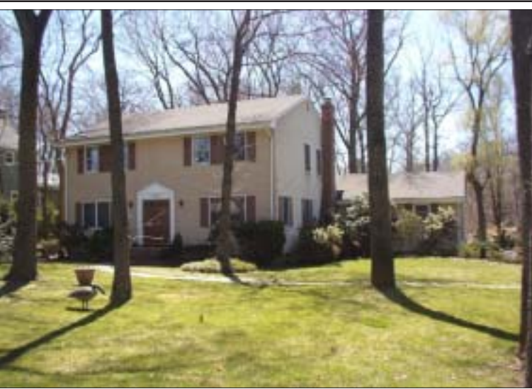
Center Hall Colonial on Beautiful half acre lot. $999,000

Committed to Providing the Highest Standards of Professionalism Integrity & Services