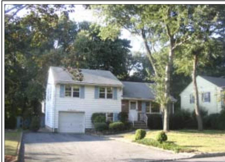
Manor Park Split - Level 3 Bedrooms, 1 1/2 Baths, Lot 65 x 132. $499,000