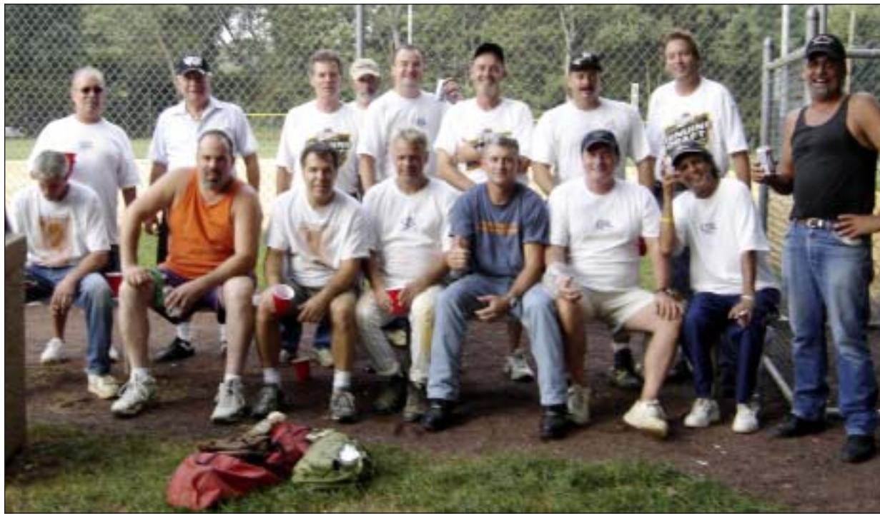
CHRONO'S TAVERN SOFTBALL CHAMPS...The Chrono's Tavern of Mountainside Annual softball game was, once again, won by the Chrono's Oldtimers, this time by a score of 7-5. Last year, the Oldtimers pulled out a 15-7 victory.