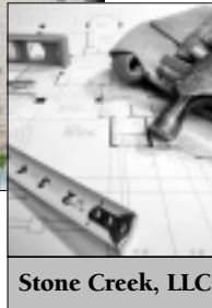
Stone Creek, LLC

231 Seneca Place - Magnificent Center Hall Colonial ready to show. Gourmet custom kitchen with granite, limestone, center island, 3 fireplaces and finished basement with wet bar, full bath and fireplace, 3rd floor au pair suite. Superior craftsmanship and attention to detail has created this impressive new home. Directions - Edgewood to Hanford to Seneca Place. WSF0069