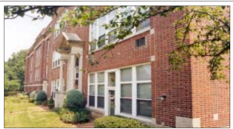
Westfield $437,500 Soho-style condo with contemporary flair. Volume ceiling, corner unit, elevator building, heated garage. Near town, NYC trans. WSF0526