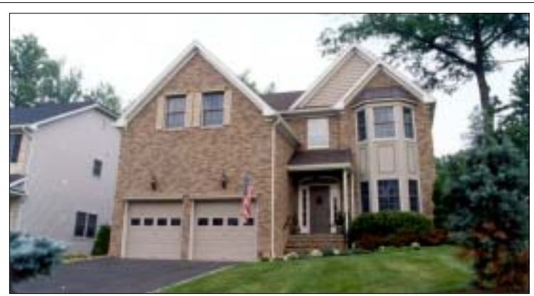
Westfield $1,055,000 Elegant CH colonial. 4 Bedrooms, 2.2 baths, 2 story entry, 9' ceilings, custom cabinets w/granite, Viking burner stove & more. WSF0506