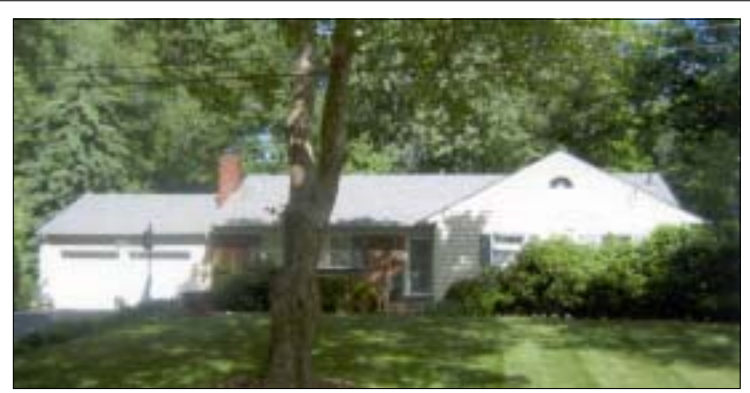
Mountainside $725,000 Sited on large private lot this ranch offers flexible floor plan, spacious rooms, large rec room & recent improvements. WSF0538

Denotes Open House Coldwell Banker Mortgage Services 888-317-5416 Concierge Services 800-353-9949 Global Relocation Services 877-384-0033 Previews International Estates Division 800-575-0952