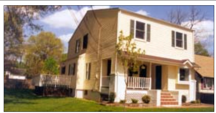
Scotch Plains $529,000 Huge home with large rooms. Master bedroom with bath, eat-in kitchen, family room, summer kitchen and more. Call for info. WSF0313