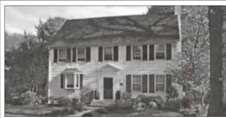
Plainfield $869,000 Outstanding CH colonial. Sparkling new top of the line kitchen, cac, master bath spa, 5 bedrooms, 4 baths, oversized deck. WSF0364