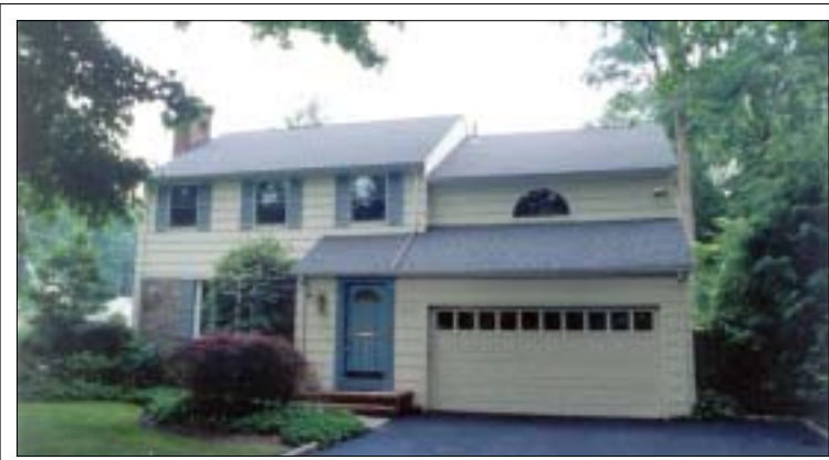
Westfield $939,000 Charming 4 bedroom colonial with great flowing family room and kitchen addition, living room with fireplace, 2.2 baths. WSF0501

Coldwell Banker®, Since 1906, America's Premier Real Estate Company