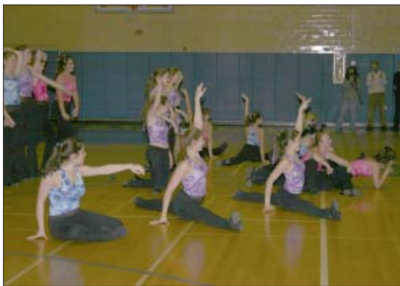
PERFORMING AT HALFTIME... The Blue Devil dancers perform at halftime during the girls basketball game between Westfield and Scotch Plains-Fanwood.

Barbara Riepe Township Clerk 1 T - 1/13/05, The Times Fee: $18.36