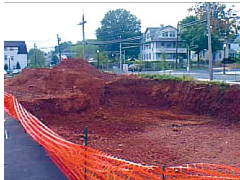
THE BIG DIG...Work has resumed at the apartments on the corner of Central Avenue and Cacciola Place in Westfield.