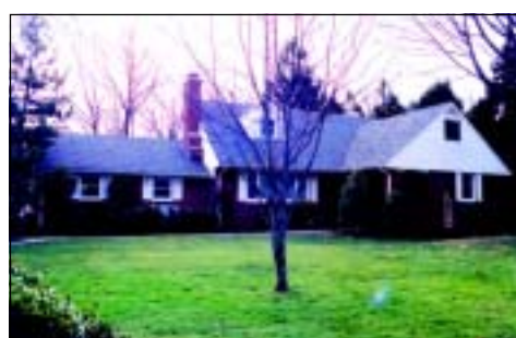
Burgdorff ERA, Realtors, 600 North Avenue West, Westfield is pleased to announce the sale of 915 Willow Grove Road, Westfield. The property was listed by Terry Monzella.