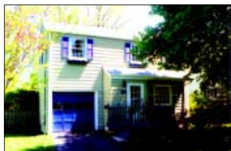
Burgdorff ERA, Realtors, 600 North Avenue West, Westfield is pleased to announce the sale of 712 Gallows Hill Road, Cranford. The property was listed by Grace Rappa.