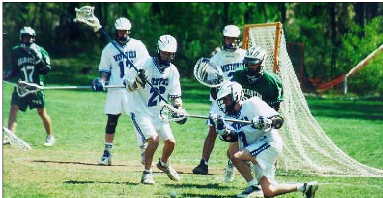
VERY DETERMINED BLUE DEVIL DEFENSE... The Blue Devil defense, in white, were very stubborn against the top-ranked Delbarton Green Wave at Tamaques Elementary School in Westfield on April 27. The Wave wavered but won, 9-6.