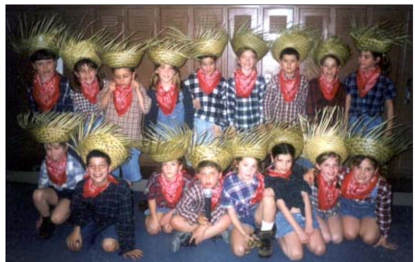
A VARIETY OF FUN...Tamaques Elementary School pupils in Westfield presented their annual variety show on March 15 and 16 at Westfield High School. Students of all grades began practicing in January, and performed to song that saluted this year's theme, "Top 40 Hits." Pictured, above, are second graders, awaiting their performance.

During these meetings, which are listed below, the board may go into private session whenever necessary: May 14, 28; June 11, 25; July 9, 23; August 13, 27; September 10, 24; October 8, 22; November 12, 26; December 10; January 14, 28; February 11, 25; March 11, 25, and April 8, 22.