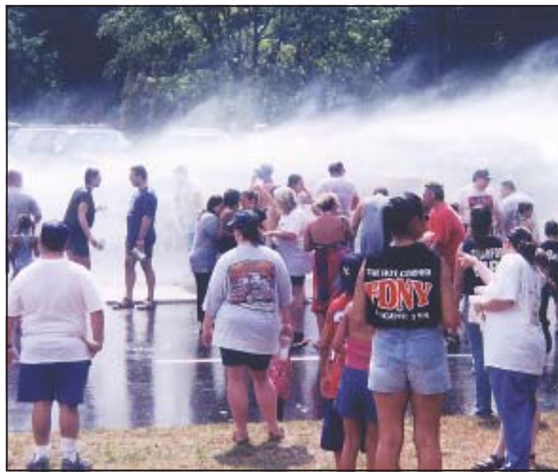
REALLY HAVING A BLAST... Many people were more than happy to get blasted with water to cool off at the annual Scotch Plains Volunteer Firemen's wetdown on August 17 at Firehouse No. 2.