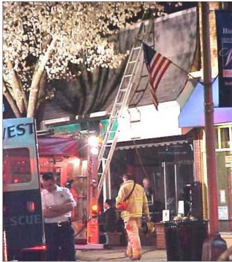
WESTFIELD'S BRAVEST IN ACTION...The Westfield Fire Department checked the roof above the Samba Grill on East Broad Street for damage after Sunday's fire. The Westfield Rescue Squad is standing by. No one was injured. Pictured, at right, three of Westfield's bravest inspect the damaged stove with Westfield Fire Chief John Castellano.