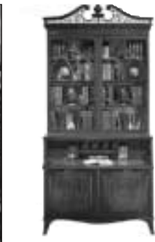
JOHN WIDDICOMB Secretary Bookcase List $28,400. SALE $13,900.