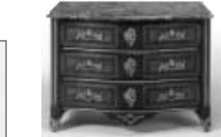
EJ VICTOR Commode List $10,079. SALE $4995