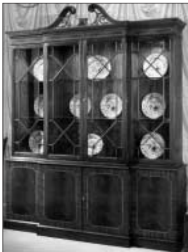
KARGES Chippendale Breakfront. List $30,940. SALE $18,500. (floor)