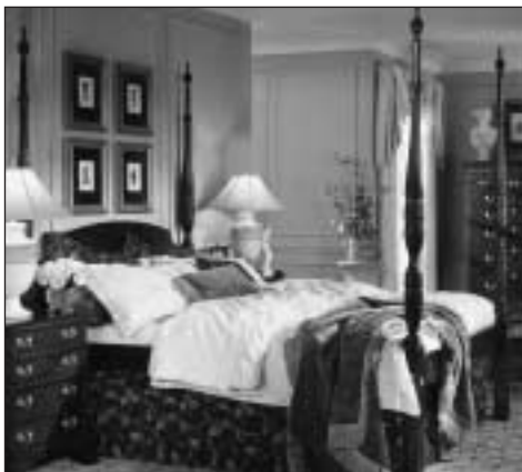
HENKEL-HARRIS Rice Carved Bed, Cherry List $6345. SALE $3173. (Queen) ('99 Floor) 50% Off Pieces made before 2000.

Extended thru November 18th SPECTACULAR REDUCTIONS!