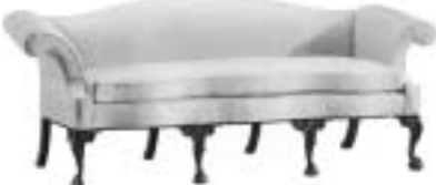
SOUTHWOOD Serpentine Camelback Sofa List $4782. SALE $2869. (floor) All Southwood Floor Samples 50% Off