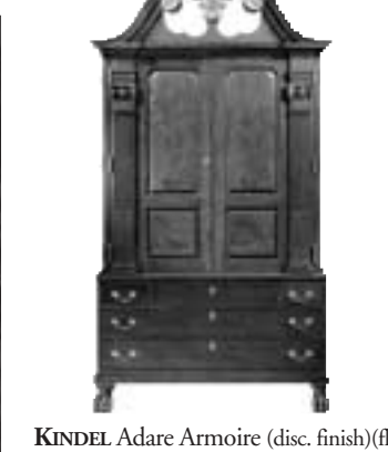
KINDEL Adare Armoire (disc. finish)(fl) List $25,310. SALE $14,500.