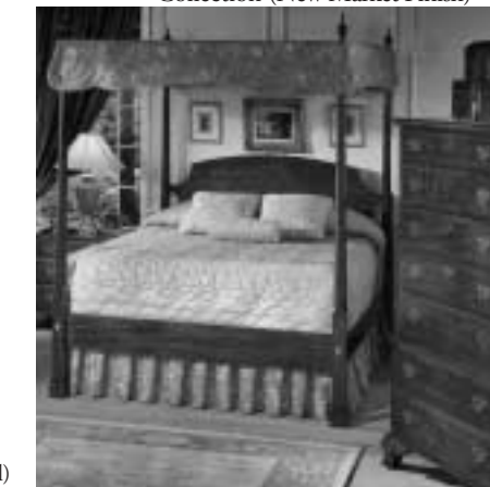
STATTON SALE - 50% Bedroom Collection (New Market Finish)