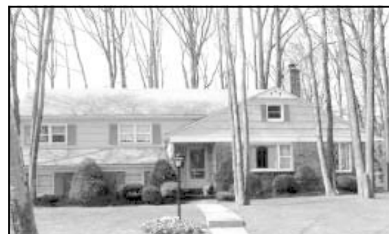
TAMAQUES PARK AREA

Well maintained, spacious 4 Bedroom WESTFIELD home on lovely landscaped property. Hot water baseboard heat, central air, hardwood floors, EIK with eating area, Family Rm, Rec Rm, laundry Room, large landscaped lot. $529,000.