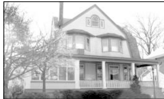
STATELY WESTFIELD COLONIAL

Turn-of-The-Century charmer on large lot near town, school & NYC transportation. 5 BRs, 3.5 Baths (including MBR Suite w/marble Bath & Whirlpool), Eat-in Kitchen w/Corian countertop & center isle, Butler's Pantry, Family Rm, Den, heated sleeping porch & wood-burning fireplace. $715,000.