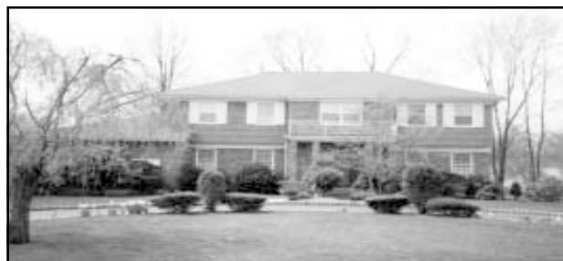
Scotch Plains Just Listed

Visit our iPIX Virtual Home Tours on www.PruNewJersey.com