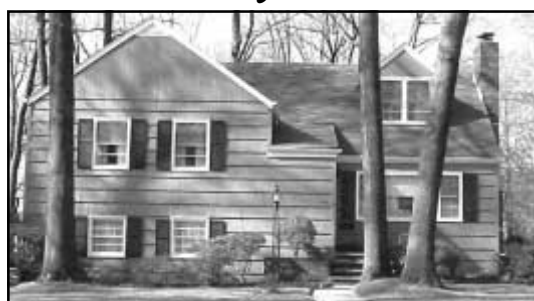
Offered at $334,500

Delightful 3 Bedroom Split near Jefferson School in WESTFIELD. Entrance vestibule, Living Room with stone fireplace & picture window, Formal Dining Room, Eat-in Kitchen and Family Room. Spacious rooms, central air, full basement, generous closet & storage space plus an attached garage and wonderful backyard.