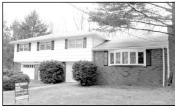
OPEN SUNDAY, 1 - 4 PM

920 BROWN AVE, WESTFIELD 4 BR grade level entry Split. Living Room, Dining Room, updated Kitchen, MBR with spa-style Bath, refinished hardwood flrs, 3 full Baths, multi-zoned heat, oversized 2-car garage and more. Dirs: Prospect to Brightwood to Brown. $379,000.