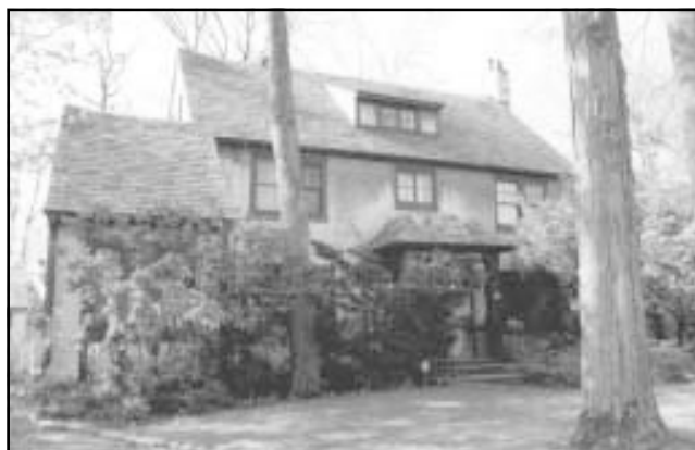
SLEEPY HOLLOW TUDOR

Spacious, bright & airy tudor home in Plainfield with 6 Bedroom, 3.5 Bath, stone fireplace, double wide lot, new security service, interior freshly painted. $359,900.00 (Visit www.edfeely.com for details)