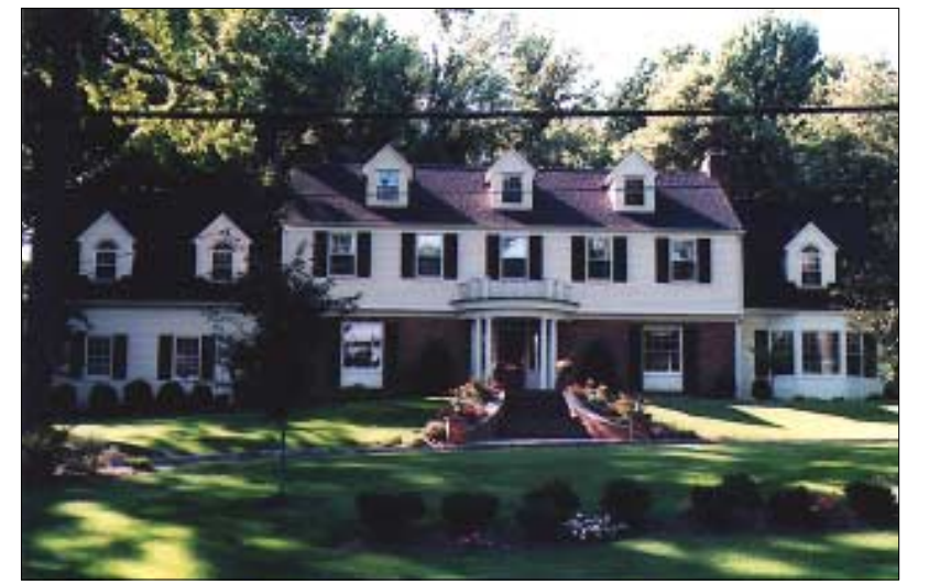
GRAND ENTRANCE... This elegant Georgian Colonial in Westfield is one of the five exquisite homes that will be open to guests on Saturday, May 5, as part of the 17th Annual Tour of Notable Homes sponsored by the Friends of the Westfield Symphony Orchestra.