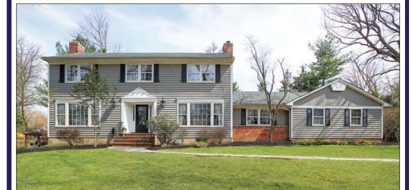
1415 Coles Avenue, Mountainside Offered at $799,000

Fabulous new construction offering 6 bedrooms and 6 full baths. Spacious open floor plans over 4 floors of living space. Lovely appointments throughout including generously sized rooms, 9ft ceilings on first floor, hardwood floors and crown moldings. Master bedroom suite with fireplace and luxurious bath. 1st floor and 3rd floor bedroom and full bath. Finished walk-out basement for optional 7th bedroom. Landscaped grounds with patio.