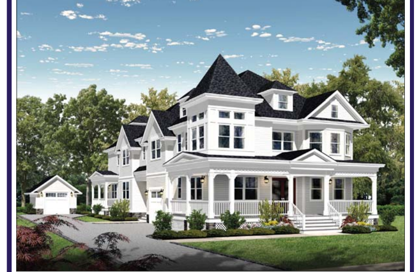
321A & 321B Elm Street, Westfield Each Offered at $1,200,000

Two exquisite Victorian townhomes offering 4 bedrooms, 3.1 baths and 5 bedrooms, 4.1 baths. Each unit features a formal living room, dining room and family room with bay window open to the gourmet, center island kitchen with SS appliances and separate dining area. Master bedroom suite with bay window, walk-in closet and luxurious master bath. Fantastic location convenient to award winning downtown Westfield and NYC transportation.