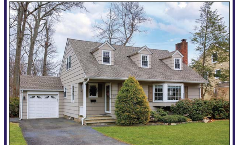
232 Evergreen Court, Mountainside Offered at $575,000

Spacious and sun filled Colonial on nearly 3/4 acre across from picturesque Watchung Reservation. Cozy den with fireplace and family room with spiral staircase to the upper level loft featuring full walls of oversized windows overlooking the backyard and beyond. Convenient first floor bedroom. Boasting a deck and a hot tub this home has plenty of indoor and outdoor space for relaxing and entertaining.