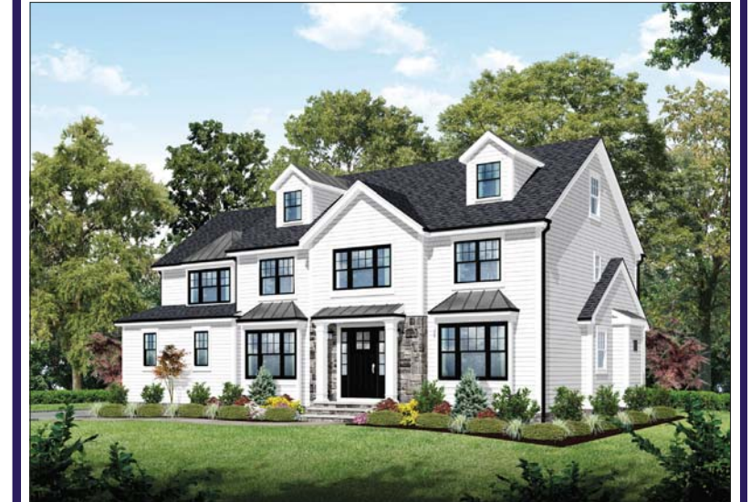
49 Moss Avenue, Westfield Offered at $1,549,000

Two exquisite Victorian townhomes offering 4 bedrooms, 3.1 baths and 5 bedrooms, 4.1 baths. Each unit features a formal living room, dining room and family room with bay window open to the gourmet, center island kitchen with SS appliances and separate dining area. Master bedroom suite with bay window, walk-in closet and luxurious master bath. Fantastic location convenient to award winning downtown Westfield and NYC transportation.