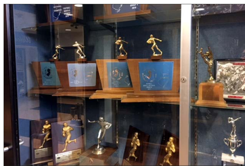
The Westfield High School Athletic Trophy Case

State (sectional) runner-up (1): 1998 GOLF, BOYS: