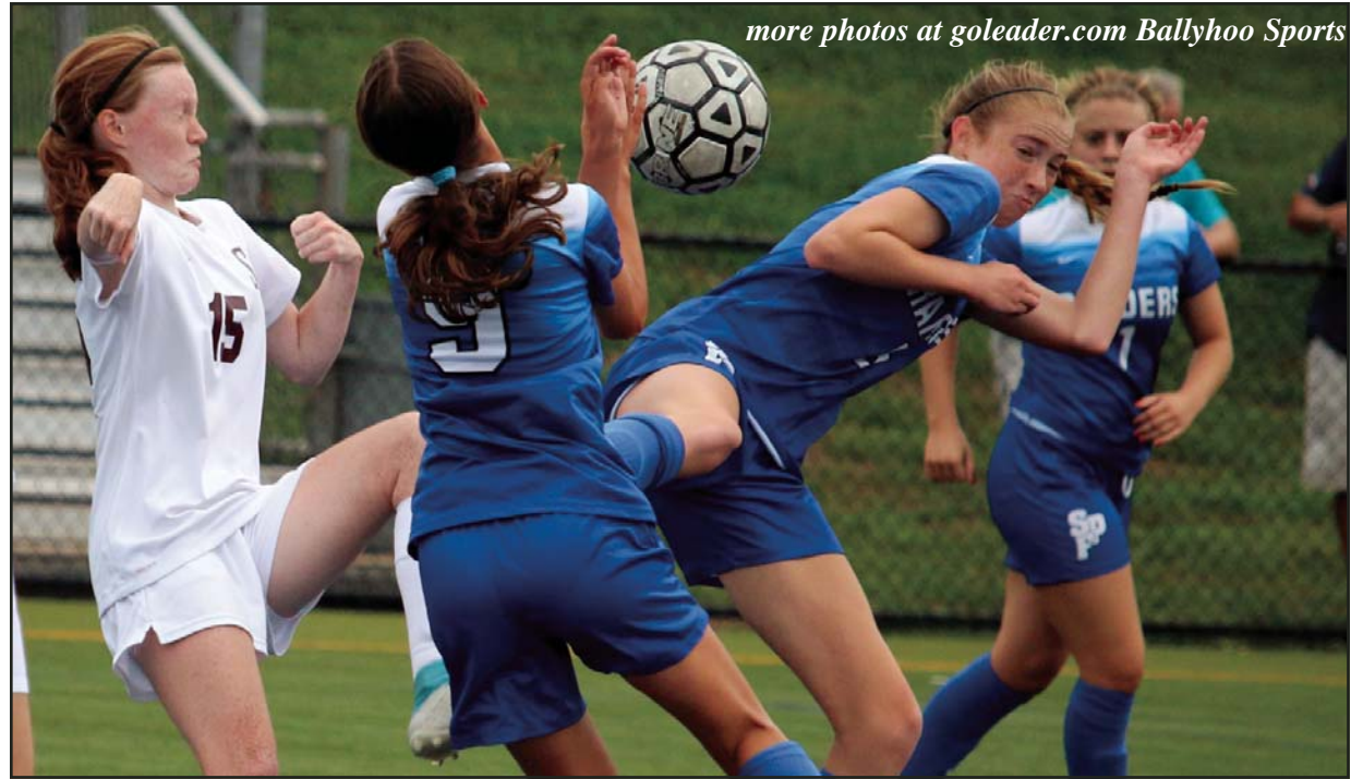
more photos at goleader.com Ballyhoo Sports