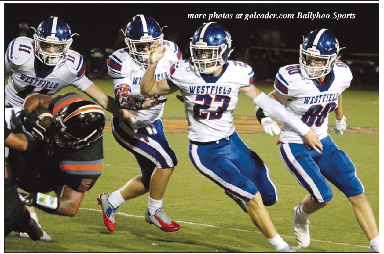
more photos at goleader.com Ballyhoo Sports