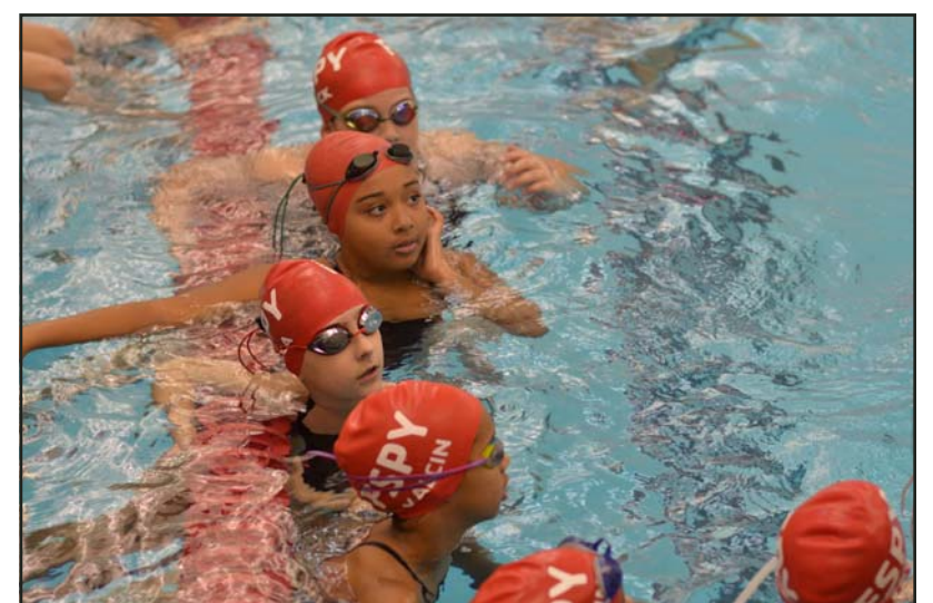
The FSPY Girls White team defeated West Essex "Y" swim girls, 198-133