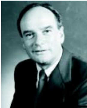
Donald T. DiFrancesco* Republican for Senate