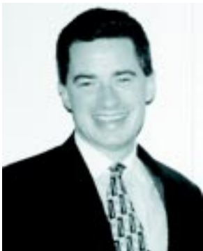
James E. McGreevey Democrat for Governor