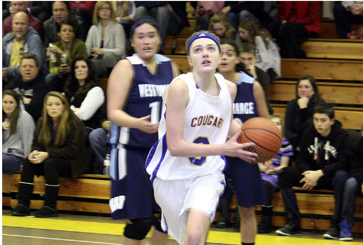
David B. Corbin for The Westfield Leader and The Times

West Orange 14 2 9 7 32 Cranford 8 7 11 12 38