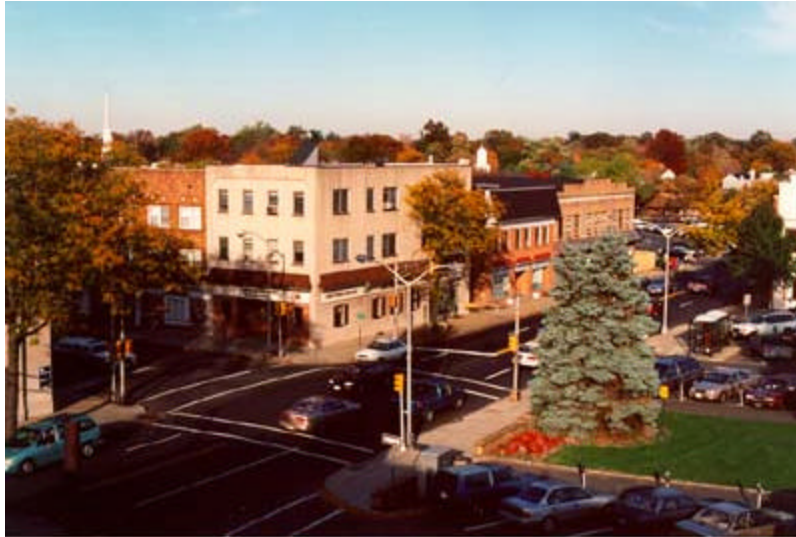
North Avenue and Elm Street

goleader.com - Union County, NJ Newspapers