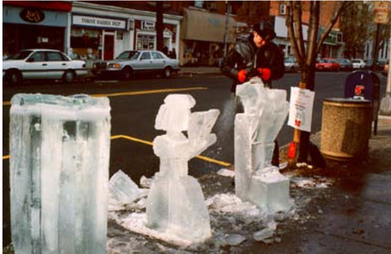
"Ice Artist at Work"