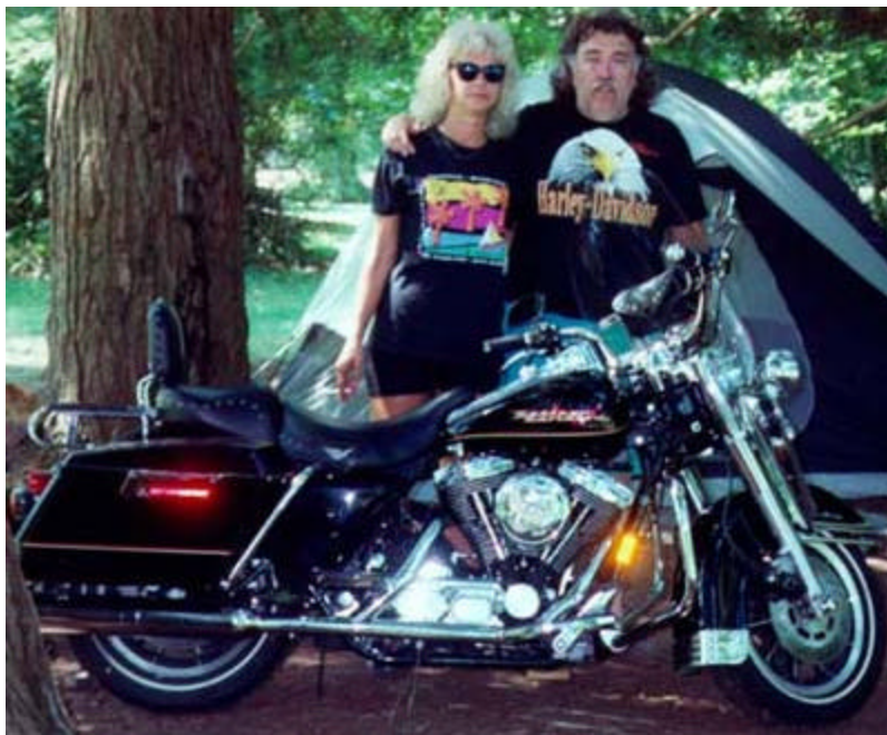
Photograph by Karen Hinds - September, 1996

goleader.com - Union County, NJ Newspapers