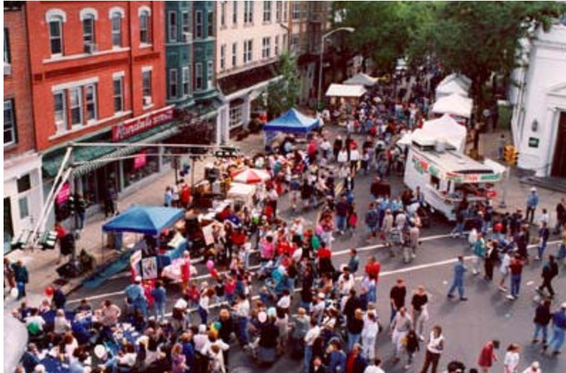
"FestiFall 96"

goleader.com - Union County, NJ Newspapers