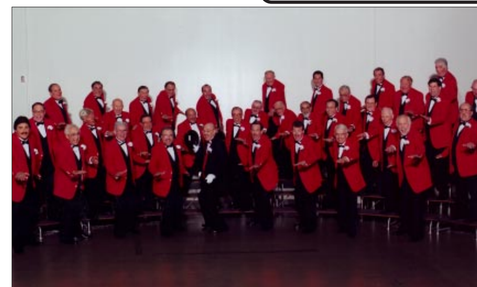
HARMONIZING TALENTS...The local chapter of Barbershoppers includes 80 members. The all-male singing group draws quartets from across the country. The chapter sponsors contests, performs at local nursing homes, churches, private parties and even delivers Valentine messages.

Please See Musical Club of Westfield Story on page 24