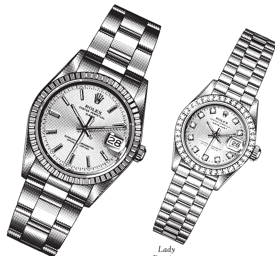
Oyster Perpetual Date

Give that special bride and groom a lifetime of happiness.