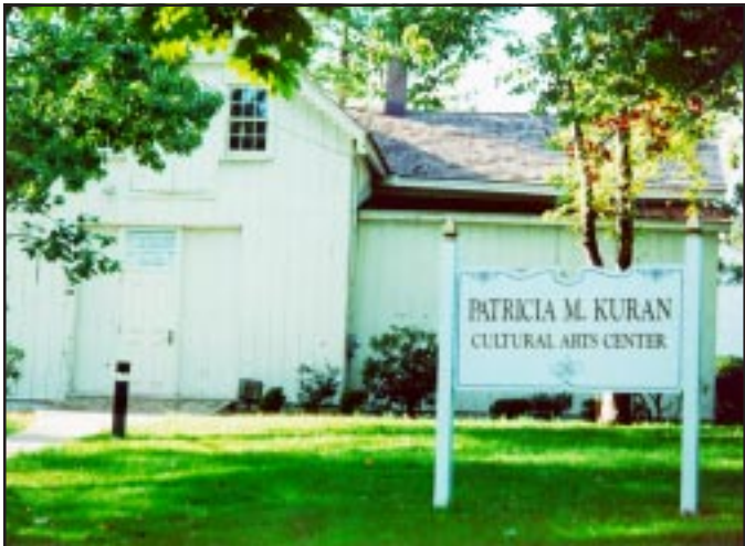
LOCAL LANDMARK... The Patricia M. Kuran Cultural Arts Center, formerly known as the Carriage House, has become the focal point of cultural activity in Fanwood.

as the Patricia M. Kuran Cultural Arts Center, and today the voices that echo throughout are those of poets, actors, writers and artists celebrating the arts.