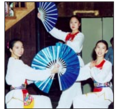
CULTURAL EXPERIENCE... The Chinese Music and Folk Dance Ensemble was among the groups which performed in a recent Multi-Cultural Festival at the Patricia M. Kuran Cultural Arts Center in Fanwood.

That same love for theater will now continue into the next millennium, as The Philathalians continue to bring quality theater to