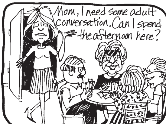
Mom, I need some adult conversation. Can I spend the afternoon here?