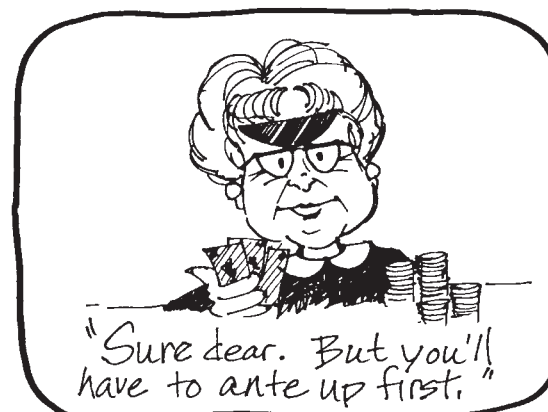
"Sure dear. But you'll have to ante up first."