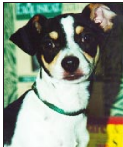
BEN NEEDS A HOME...People for Animals, a non-profit animal welfare organization serving New Jersey, will sponsor a pet adoption event on Saturday and Sunday, August 14 and 15, from 11 a.m. until 3 p.m., at the PetsMart store, 1022 Route 22 East in North Plainfield. Many dogs, cats and lots of kittens will be available. Among these pets will be Ben, a 6-month old Jack Russell terrier and Chihuahua mix who is neutered and current with his vaccinations. This 10-pound dog is considered well mannered for a puppy and has a good disposition to be a family pet. He is housebroken, playful and good with other pets. To adopt a pet, or for pet information, please call (908) 688-1073 or visit www.petfinder.org/shelters/NJ17.html . For low cost spay/neuter information, please call the People for Animals Clinic at (908) 964-6887.

For more information, please visit the Toastmaster Web site at www.westfieldnj.com/toast .