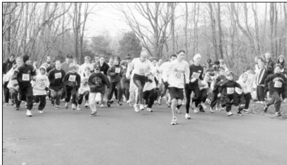
AND THEY'RE OFF...Close to 400 runners participate in the annual Turkey Trot five-mile run held every November at Tamaques Park in Westfield.

* all parks close at Dusk except as noted above.