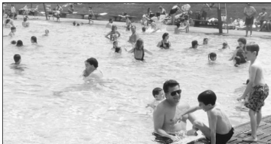
SPLISH-SPLASH...Area residents enjoying a day at the Westfield Memorial Pool. The complex boasts of four pools – a 50-meter, diving, training and kiddie pool.