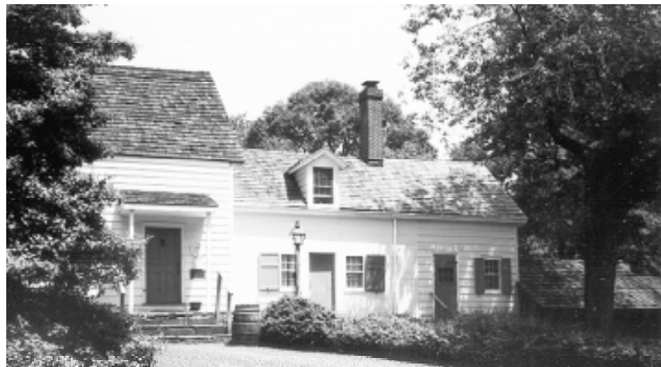
The Miller-Cory House Museum, 614 Mountain Avenue, Westfield