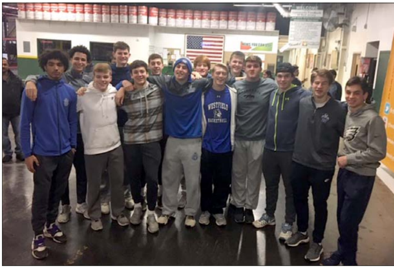
LENDING A HELPING HAND...On January 5, the Westfield High School boys Varsity basketball team volunteered at the Community food bank of NJ in Hillsdale to help provide meals for over 1,500 families throughout NJ.