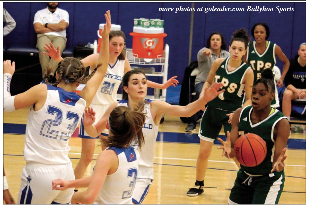
more photos at goleader.com Ballyhoo Sports