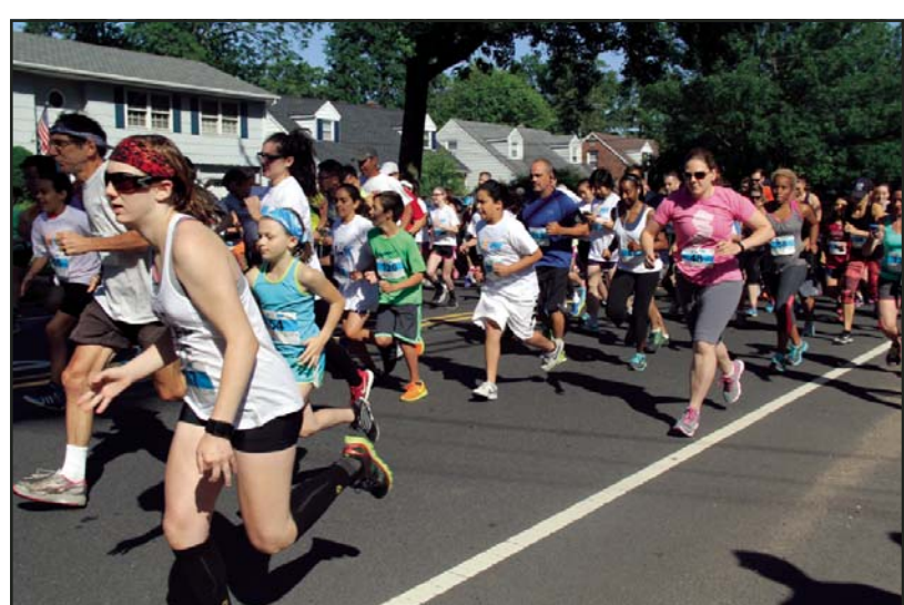
COMMUNITY RUN...Runners race in the Centennial Village Velocity 5K Race Sunday morning in Cranford. The race was sponsored by the Centennial Village Group, which works to beautify and revitalize Cranford's Centennial Village business district.