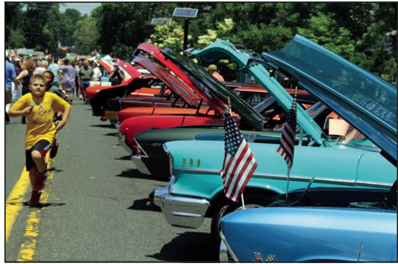
AMERICAN CLASSICS...This classic car show was a popular attraction at Sunday's second annual Garwood Rocks! festival.