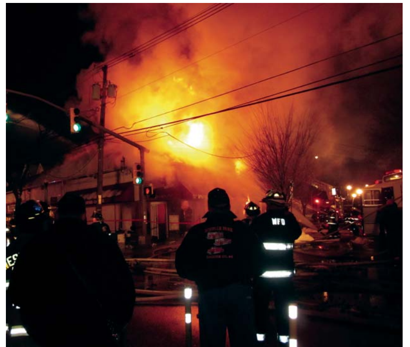
INFERNO...Flames and heavy, black smoke fill the air on Sunday when a six-alarm fire ripped through a row of businesses on South Avenue, West, in Westfield.