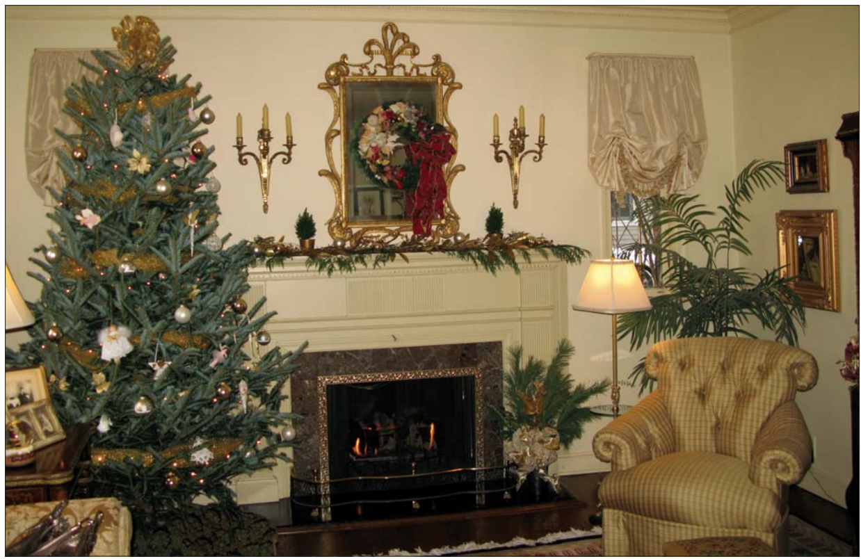
HOME SWEET HOME...During the Home for the Holidays house tour held Saturday in Westfield, tour-goers got a glimpse inside this Wychwood Road home featuring interwoven glimmers of golden ribbons and ornaments, which adorned the Christmas trees, wreaths and the fireplace mantel swag, keeping in perfect harmony with the home's gold color scheme.