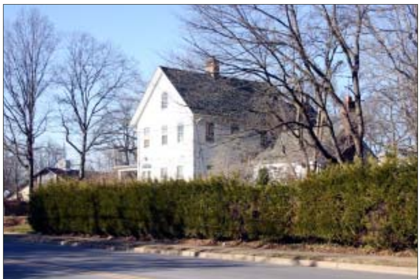
FUTURE PARKLAND...Union County has purchased the property at 370 Madison Hill Road in Clark, pictured above, currently occupied by a single-family home. The property, acquired for $600,000, is located adjacent to St. Agnes Parish of Clark, and is earmarked for additional parkland.