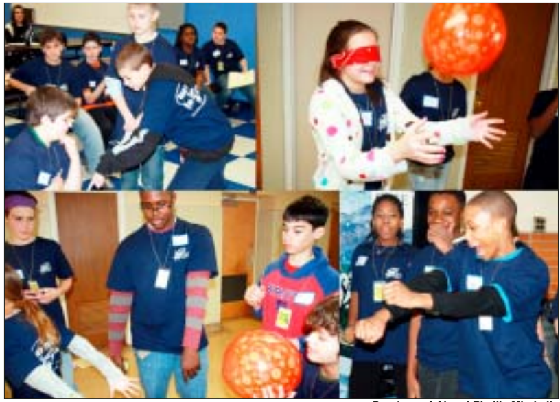
LIFE LESSONS...The Mini-Leadership Training Conference (LTC) program, Many Stars - One Universe, was held last Saturday at Scotch Plains-Fanwood High School. Middle school students were taught public speaking, effective communication and leadership, team building and problem solving through collaboration. More than 100 middle school students from Park and Terrill schools attended.