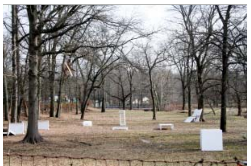
A GOOD USE...The former Terry Lou Zoo property in Scotch Plains, owned by the township, is put to good use with an obstacle course for training and exercise of its police K-9 units.