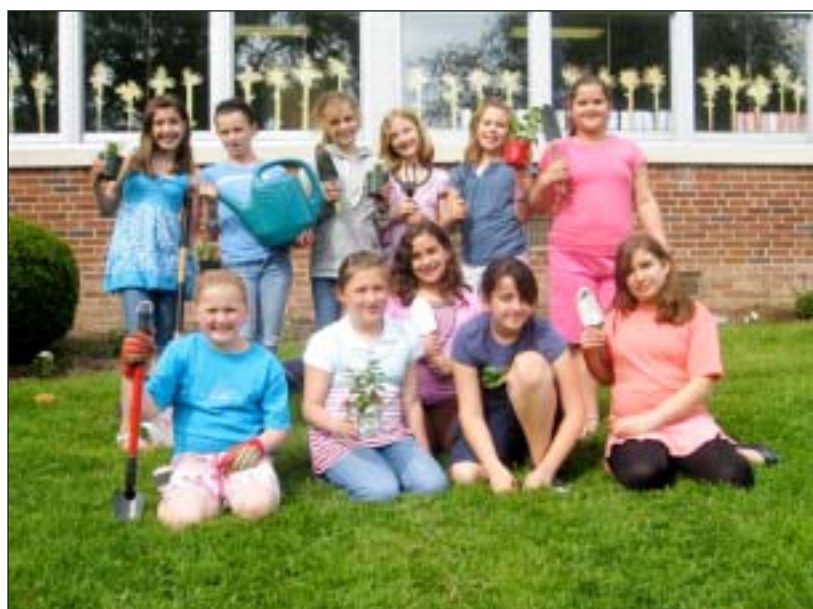
BEAUTIFICATION PROCESS...Members of Junior Girl Scout Troop 146 spend a recent afternoon beautifying their school, Evergreen Elementary in Scotch Plains, by planting flowers around the side of the building. The bright spring colors of marigolds, petunias and other assorted blooms have brought a warm greeting to the students, staff and visitors entering the building.

On Thursday, August 27, Hazak Barbecue, sponsored by Temple Beth Ahm Yisrael's seniors group and open to the public, will be held at 6:30 p.m. Those interested are asked to call the temple office for details.